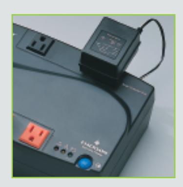
All outlets are spaced to accommodate transformer plugs.